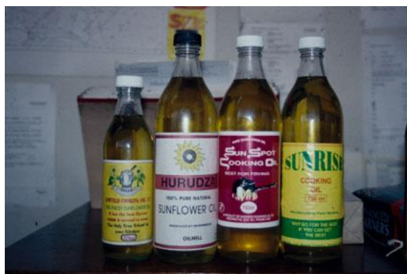
Figure 6: The final product in Zimbabwe