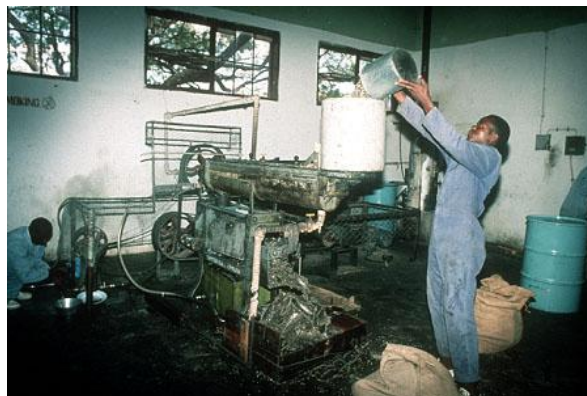
Figure 5: Tinytech oil expeller in operation in Zimbabwe.