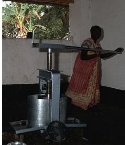
Figure 4: A manual screw press

The crude expelled oil contains solid particles. These can be removed by allowing the oil to stand