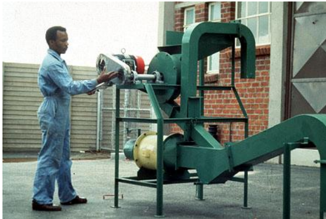
Figure 3 : Decortication (removal/winnowing of husks) machine for sunflower seeds. The decortication machine is used in conjunction with Tinytech oil mills.

Most oil-bearing seeds need to be separated from their outer husk or shell. This is referred to as shelling, hulling or decorticating. Shelling increases the oil extraction efficiency and reduces wear in the expeller as the husks are abrasive. In general some 10% of husk is added back prior to expelling as the fibre allows the machine to grip or bite on the material.