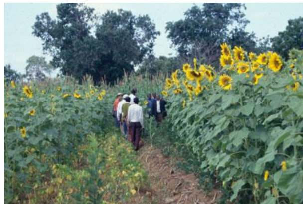
Figure 2: Sunflowers grown in Kenya

In many countries the oil processing sector is highly politicised and regulations exist which make entering the market difficult and tend to support the monopoly of the large processors. Large refineries may, for example, insist that farmers sell all their seed under a contract. In other cases seed has to be sold to a central Government marketing board, the board also supplies seed for planting.