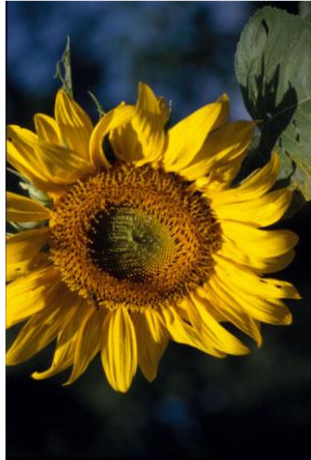
Figure 1: Sunflower.